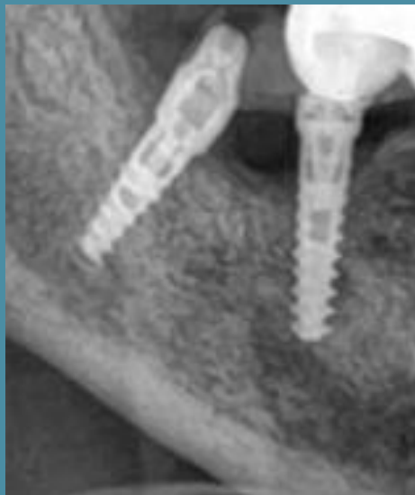
CBCT scan 6 months after bone grafting 3 months after implantation