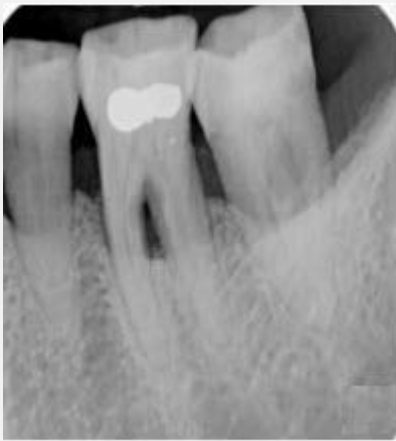
Periapical x-ray scan Before extraction and bone grafting

By: Doctors at the Clinic for Oral and Maxillofacial Surgery, Shamir Medical Center