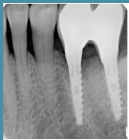
Periapical x-ray scan 4 years after grafting - with bridge