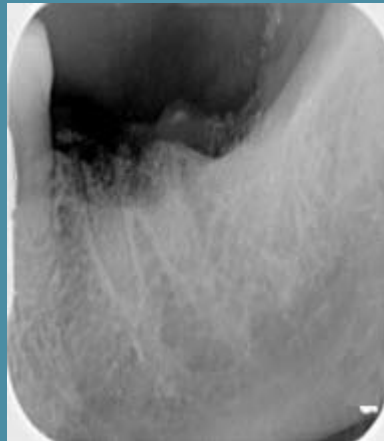
Periapical x-ray scan After extraction and bone grafting (a)