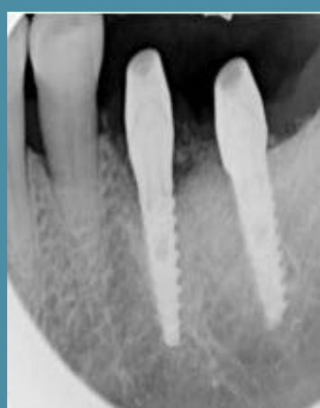
Periapical x-ray scan 4 months post grafting - implant placement